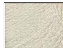
#1 - White