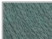
#35 - Spruce