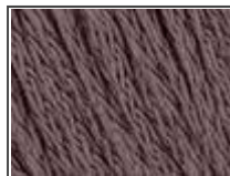
#37 - Warmth