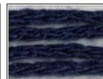
#25 - Midnight Blue